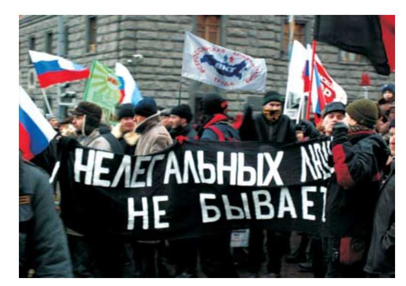
"There's no such thing as 'Illegal People" proclaims a banner carried by activists in Moscow, Russia. Over 3000 people participated in an anti-fascist demonstration on 18 December 2006 in Moscow. The VKT , one of the Russian trade union confederations, joined in to protest against the increasing nationalism in Russian society.

Unions worldwide are invited to celebrate this day, to undertake actions calling for the protection of migrant workers' rights, and to call for the governments to ratify the UN Convention on Migrant workers as well as the ILO Conventions No.97 and No.143.