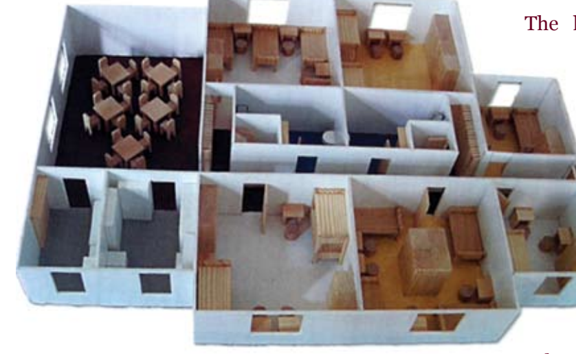
'Saisonarbeiterwohnungsbau: Lösungen für die Wanderarbeitnehmerin der Landwirtschaft' IG-BAU, Berlin www.igbau.de

least 21C in winter. Men and women should have separate bathrooms and toilets. The employer should also provide a dryer for drying work clothes, and a wardrobe for storing clothes.